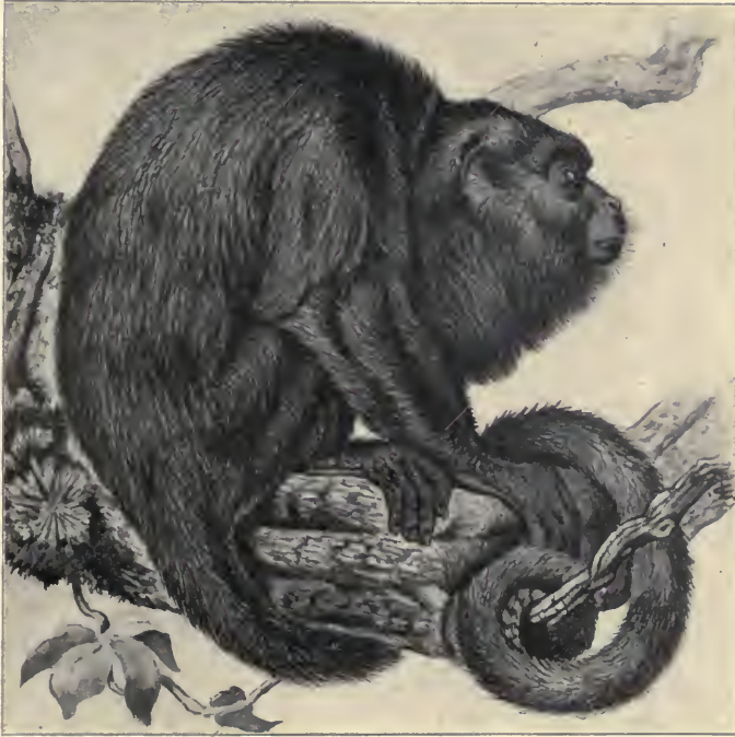
FIG. LXXXI. ALOUATTA PALLIATA. MANTLED HOWLER.

Alouatta palliata Elliot, Mamm. Middle Amer. & W. Indies, F. C. M. Pub., IV, Pt. II, 1904, p. 726, fig. cxxxviii. Zool. Ser. Id. Check-L. Mamm. N. Amer. Cont. & W. Indies, F. C. M. Pub., VI, 1905, p. 533. Zool. Ser.